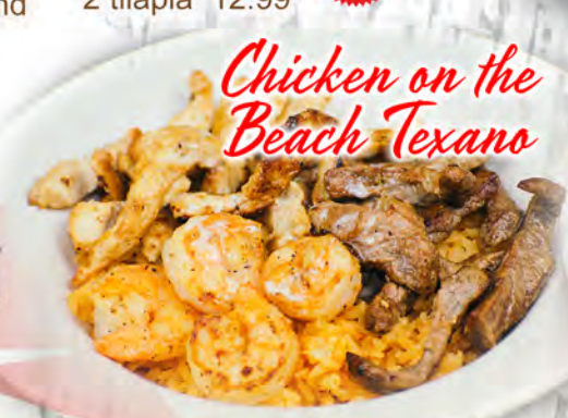
Chicken on the Beach Texano