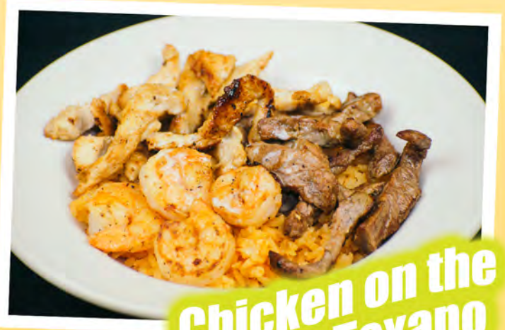
Chicken on the Beach Texano